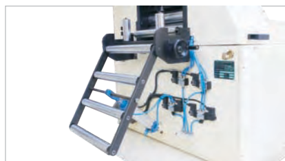
Roller Threading Arrangement