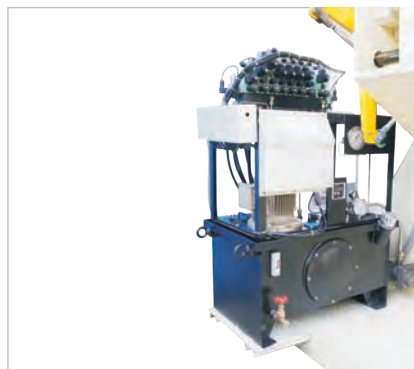
Hydraulics and Valve Arrangement