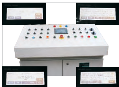
Control Panel with Touch Screen Programming for simplicity in Parameters feeding